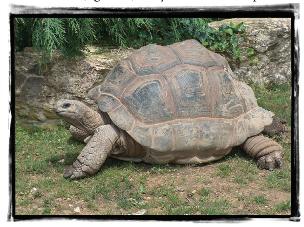
Figure 3: Tortoise – "This resembles two things, the slow and long process of trying to reach for your dream and also resilience" - Ruvashe from Zimbabwe

credentials, and found meaningful employment. Like the tortoise (figure 3) they continued to persevere.