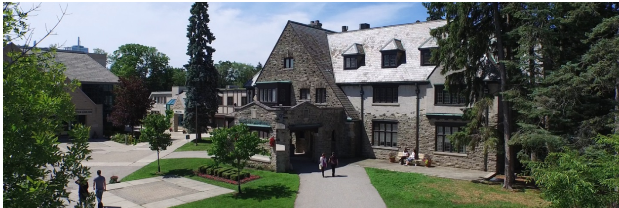
King’s University College Campus